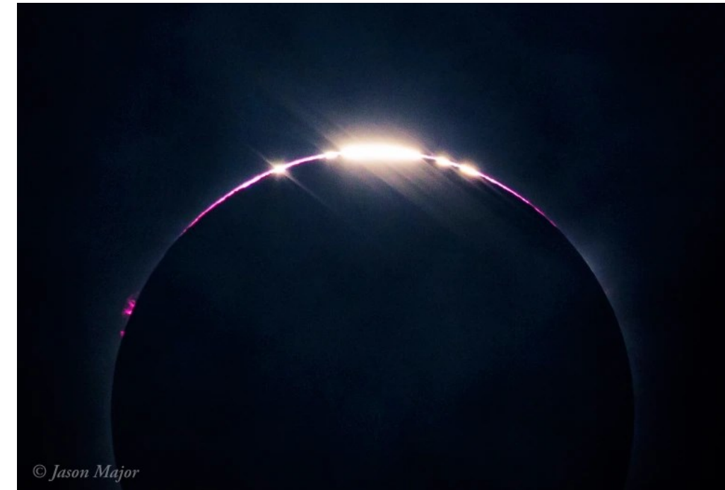
Baily's Beads, photographed at Charleston, South Carolina during the August 21, 2017 total solar eclipse.

Church Office Hours: Monday - Friday: 9am - 5pm Other Staff: By Appointment