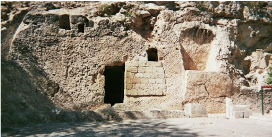
The Garden Tomb in Jerusalem, unearthed in 1867 and considered by some Protestants to be the site of the burial and resurrection of Jesus. The tomb is north of the city wall and dates from the 8th-7th Cent. BCE. Catholic tradition since the 4th Cent. favors the Church of the Holy Sepulchre, located inside the city wall.

THE WORSHIP OF GOD Easter Sunday April 9, 2023 Ten O’clock in the Morning Memorial Baptist Church Buies Creek, North Carolina