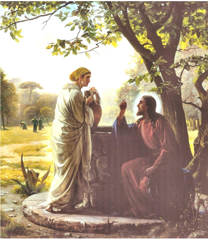
“Jesus and the Samaritan Woman,” by Carl Heinrich Bloch. 1872, oil on copper. National History Museum, Frederiksborg Castle, Denmark.

Church Office Hours: Monday - Friday: 9am - 5pm Other Staff: By Appointment