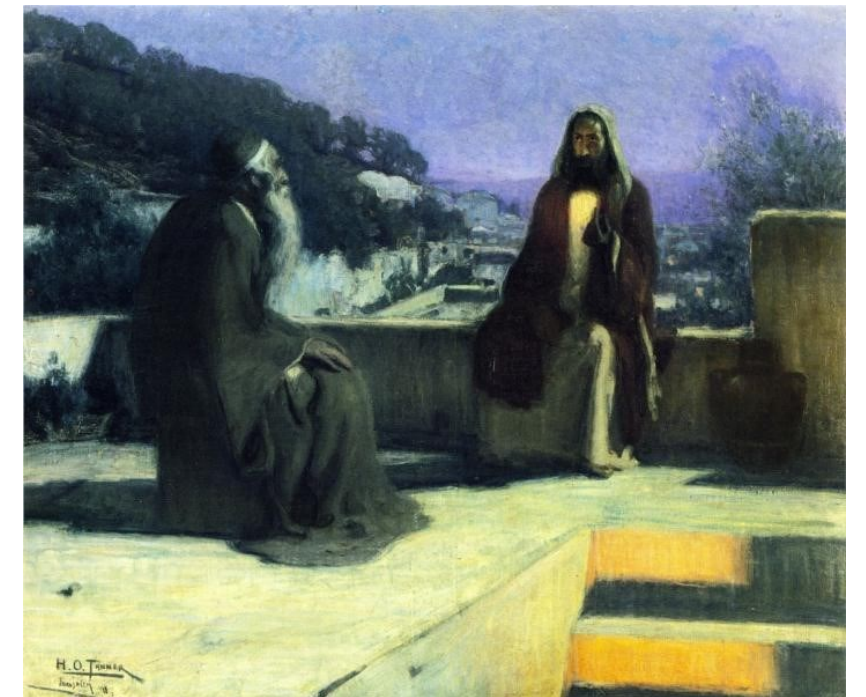
"Nicodemus Visiting Jesus," oil on canvas by Henry Ossawa Tanner, 1899, Pennsylvania Academy of the Fine Arts, Philadelphia

Church Office Hours: Monday - Friday: 9am - 5pm Other Staff: By Appointment