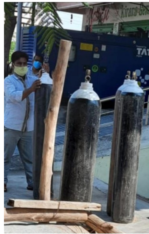
Oxygen tanks in India donated by churches.

11 Friends Class - Sunday School: 8:45 a.m. (Zoom) Sarah's Open Door Class - Sunday School: 9 a.m. (Zoom) Indoor Worship Service: 10 a.m. * No Youth Sunday School or Bible Study